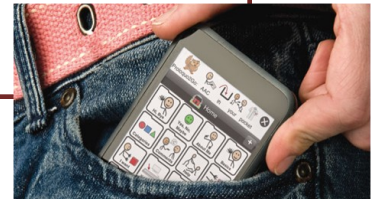
Communication on the Go for iPhone, iPod touch and iPad

One special education teacher through Model Demo reported: