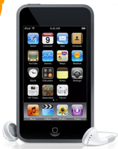
$189 ProloQuo2Go $199-$399 iPod Touch