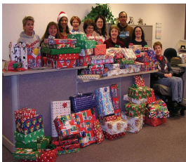
NDCPD Staff with gifts for the 2007 Giving Tree.