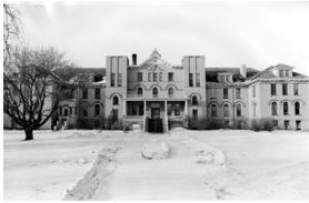
Grafton State School

“In addition to expanding their own horizons, they bring disability issues into the mainstream of campus life...”