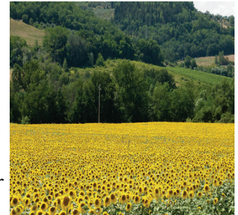
Sunflower fields of North Dakota.

The fall season is truly a season of change in North Dakota (ND). ND farm families will look back on their efforts and struggles to plant and grow healthy, profitable crops. Hopefully the harvest season brings forth prosperous results. These families then can begin their future planning and preparations for next year. As the leaves change colors and the fields change from green to golden brown we also take time to reflect on our NDCPD spring and summer accomplishments. This October NDCPD staff will carefully examine our grant proposal and revenue development activities (the planting season) and see how our funding requests (the harvest) brought forth new projects. From this examination and reflection, staff will plan for another year of fruitful work in research, training, information dissemination and services for ND citizens with disabilities.