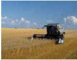
Harvesting time in North Dakota.