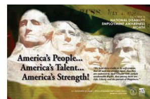
2008 National Disability Employment Awareness Month theme emblazoned on an image of Mount Rushmore National Memorial.

The ultimate goal is to have ND meet the 1-3-6 month timelines for detection, assessment and intervention of hearing loss for all newborns in ND. Having accurate, timely data will assist our ND EHDI program in achieving this goal.