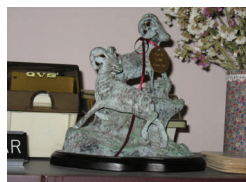
Ram Good Job Award

The Ram Good Job Award is given to a staff member each month to recognize them for doing such a "ram good job". This award is given by the preceding month's award recipient, and honors the staff member's work to enhance the lives of people with disabilities and further the center mission. Winners over the past months include: