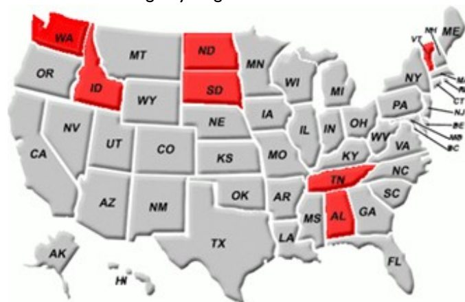
States in red do NOT have a screening mandate (NCHAM, 2008)

For North Dakota, this equates to about 10 born profoundly deaf with another 20-30 born with partial hearing loss each year. In 2009, North Dakota was only able to report 13 cases of hearing loss. We have a long way to go.